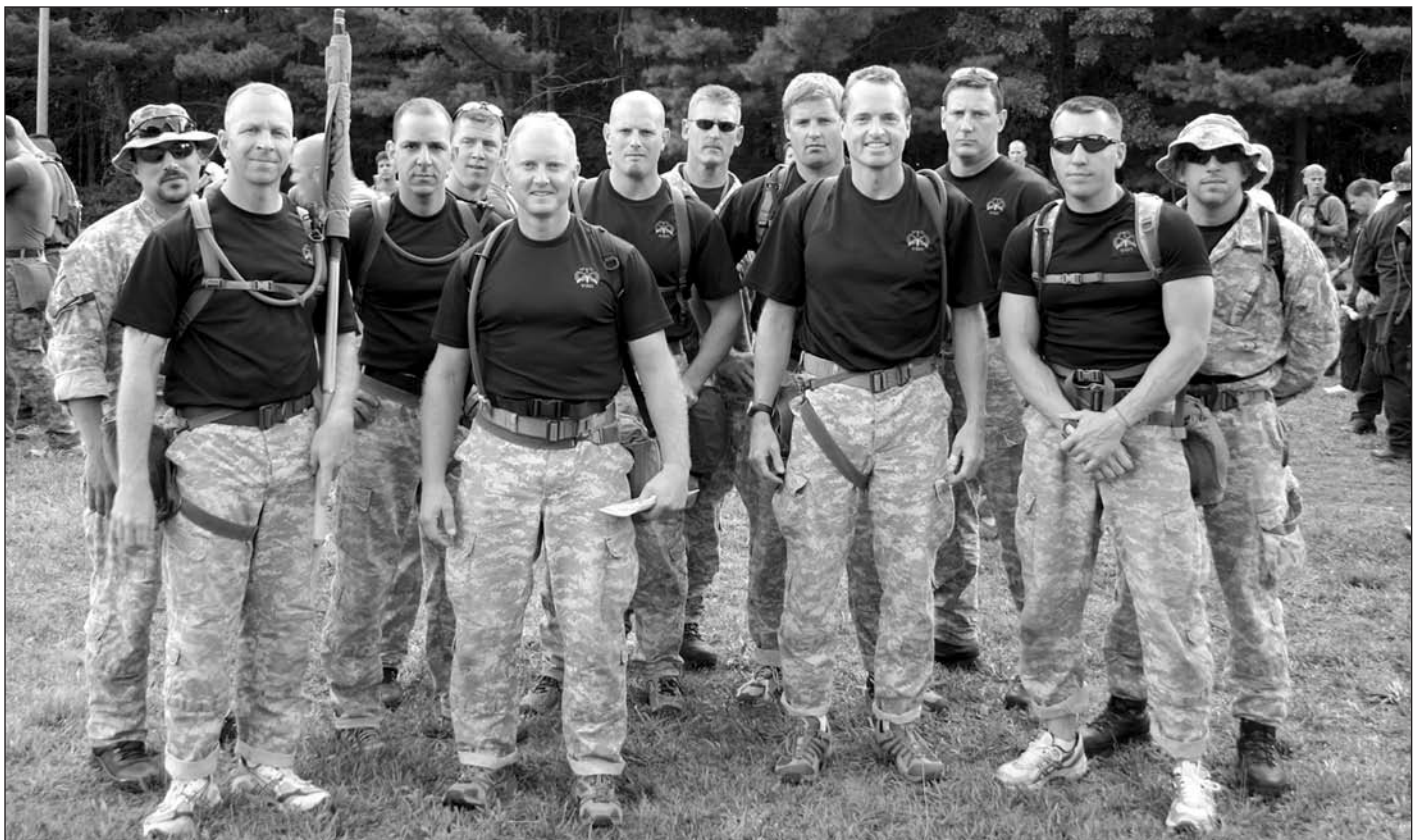
CSP SWAT Team West before PT Challenge.

fired shots during several courses of fire at known and unknown distances. Cold bore, coordinated fire, through intermediate barriers, varied position and varied distance were the areas and conditions the snipers teams competed in. The remaining events tested each team operator's handgun, rifle and shotgun marksmanship skills to effectively engage targets while under physically induced stress and under time constraints. For all operator events full tactical equipment was worn. Several of the events required team operators to carry a 185 pound dummy, negotiate obstacles (6' and 8' foot walls), while wearing gas masks. The Physical Fitness Challenge proved once again to be not only physically demanding but mentally tough as well. The 6.2 mile course was conducted at the West Hartford Reservoir and required all 8 team members to run the course and negotiate all obstacles with a 25 pound ruck-sack. The event began with a Puggle-Stick joust to determine who would begin the course first. Throughout the course team members paddled canoes, climbed hills, monkey bars, ropes and peg boards, traversed cables, rolled 750 pound tires, carried 185 pound dummies, overhead pressed team mates