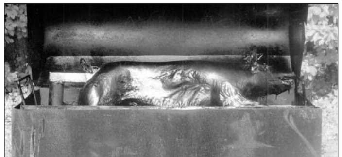
The "guest of honor," a 130-pound pig.